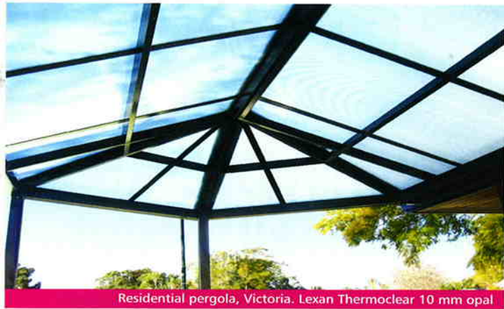
Residential pergola, Victoria. Lexan Thermoclear 10 mm opal

Curved glazing – sheet can be cold-formed into tight radii without pre-forming. Generally, the minimum radius is 175 x the gauge. Ampelite have specialised glazing systems for curved applications.