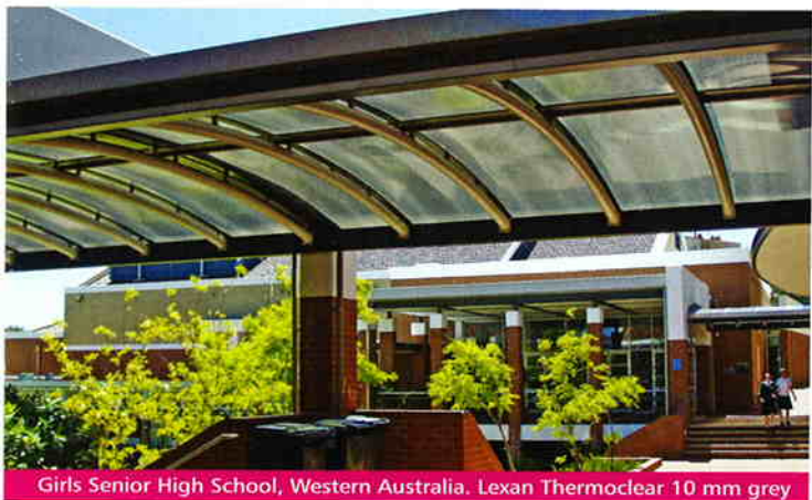
Girls Senior High School, Western Australia. Lexan Thermoclear 10 mm grey